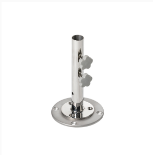
Center Post Base Plate and Spigot 50mm