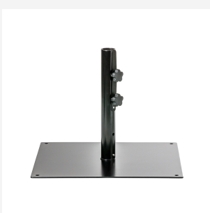
Flat Base Plate - 50mm