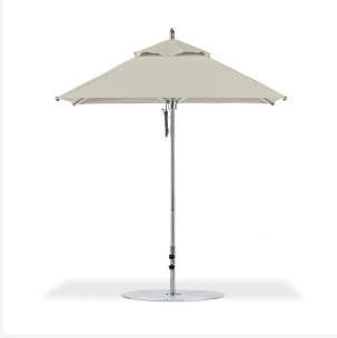
Greenwich Premium Patio Umbrella - 3m square