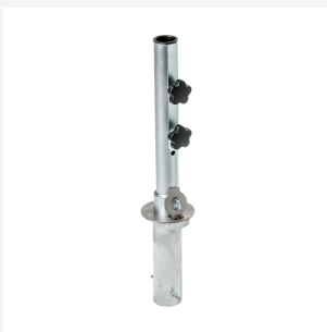
In-ground Socket & Sleeve Kit - 50MM