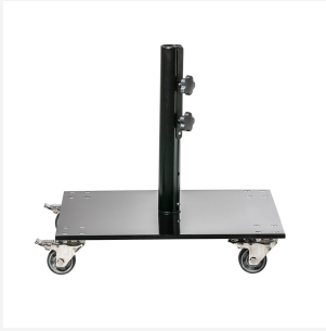
60cm Heavy Wheeled Umbrella Base Plate - 50mm Spigot