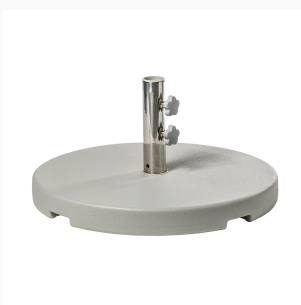
65cm Grey Concrete Umbrella Base - 50mm Spigot