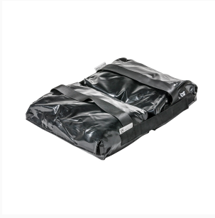
Set of 2 PVC Sandbags - Grey